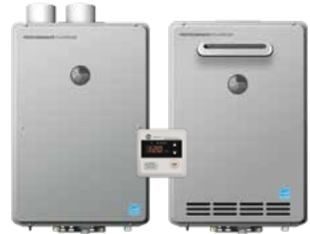
Indoor Direct Vent