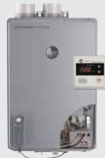
Indoor Direct Vent with EcoNet® 11,000-199,900 BTU/h Only (Outdoor model also available)

Shares all efficiency, performance, technology, warranty and safety values as standard models, with added WiFi capability.