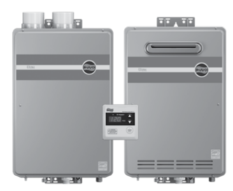
RUTGH-DVL RUTGH-XL Indoor Direct Vent Outdoor 11,000-199,900 BTU/h Natural and LP Gas