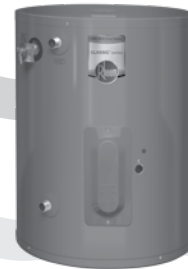
6, 10, 15, 19.9 and 30-Gallon