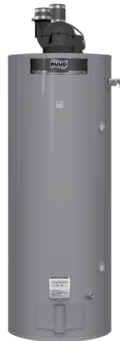
Professional Achiever Plus Power Direct Vent 50-Gallon Capacities Up to 65,000 BTU/h Natural and LP Gas

Units meet or exceed ANSI requirements and have been tested according to D.O.E. procedures. Units meet or exceed the energy efficiency requirements of NAECA, ASHRAE standard 90, ICC Code and all state energy efficiency performance criteria.