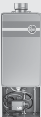
RTG-RC95DVLN-1 Indoor DV Only 11,000-199,900 BTU/h Natural and LP Gas

Same specifications as standard Mid-Efficiency models with added water savings and faster hot water.