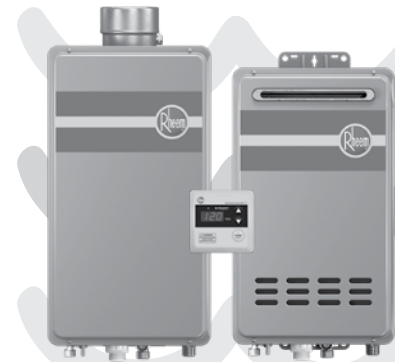
RTG-DVL Indoor DV 11,000-199,900 BTU/h Natural and LP Gas RTG-XL Outdoor 11,000-199,900 BTU/h Natural and LP Gas

See Warranty Certificate for complete information