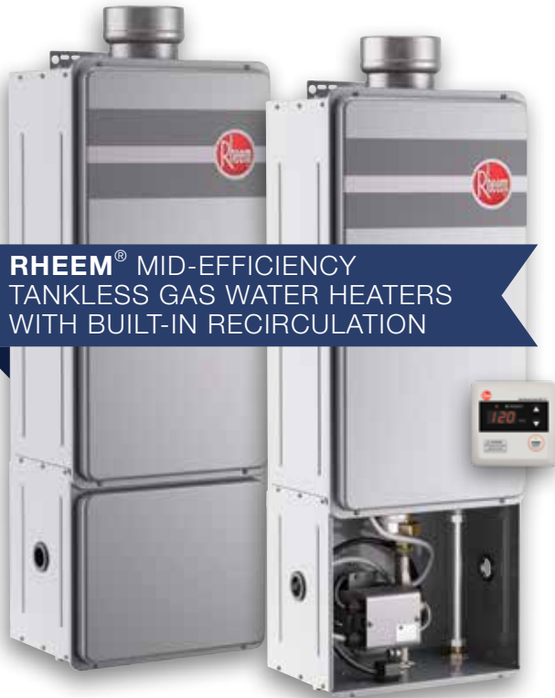
RHEEM® MID-EFFICIENCY TANKLESS GAS WATER HEATERS WITH BUILT-IN RECIRCULATION