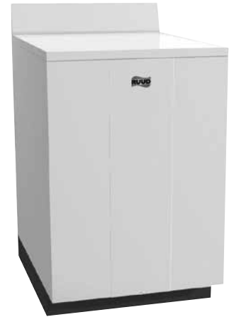
Table Top Water Heater Large Counter Surface 40-Gallon Capacity 240 Volt AC/Single Phase Electric

Units meet or exceed ANSI requirements and have been tested according to D.O.E. procedures. Units meet or exceed the energy efficiency requirements of NAECA, ASHRAE standard 90, ICC Code and all state energy efficiency performance criteria.