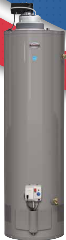
Encore XR90 Induced Draft 29-Gallon Capacity 60,000 Btu/h Natural Gas