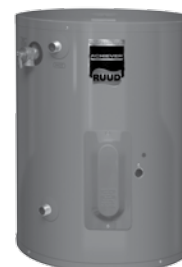
6, 10, 15, 19.9 and 30-Gallon