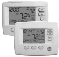
200-Series * Programmable