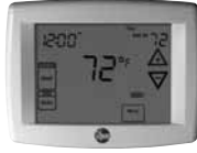
300-Series * Deluxe Programmable