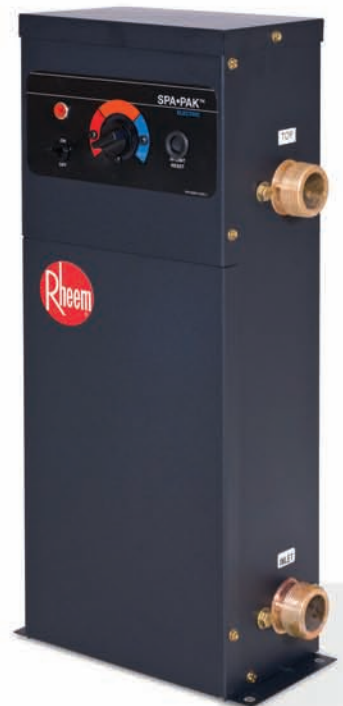
RHEEM ELS 552 and 1102