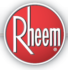
The new degree of comfort.™