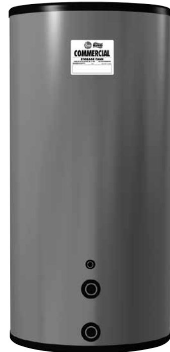
Ruud Commercial Storage Tanks 80, 115 and 175-Gallon Capacities

T&P valve | Must be ordered separately based on water heater Btu/h input.