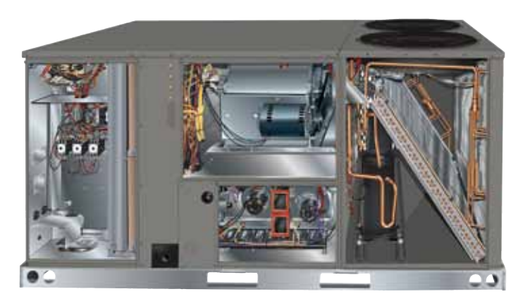
RKRL-C Package Gas Electric (7 ½, 10, 15 & 20 Ton Models), RLRL-C Package Air Conditioner (7 ½, 10, 15 & 20 Ton Models), RKRL-H Package Gas with VFD (7 ½, 10, 15 & 20 Ton Models), RLRL-H Package Air Conditioner with VFD (7 ½, 10, 15 & 20 Ton Models)