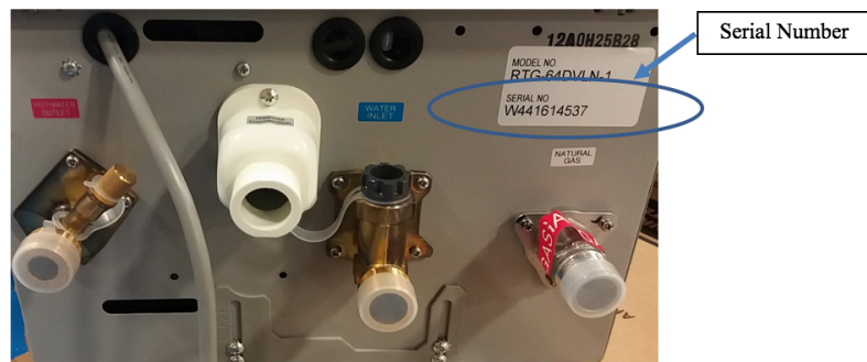
Location of rating plate on bottom of unit (secondary location).